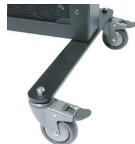
Large diameter for easy roll and pivot, as well as total-lock for high stability.

Moving TeamBoard Total Mobile closer or further from an audience is a snap, with its large casters that permit easy rolling. The casters are also 'total lock' to prevent unwanted rolling and pivoting. Drop to the lowest setting and roll through a standard size doorway, your TeamBoard is now easy to relocate—ideal for shared-technology environments.