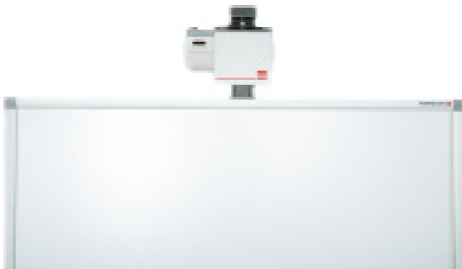
TeamBoard UST Projector 0.19 featured with TeamBoard Total Mobile and TeamBoard T4 Interactive Whiteboard